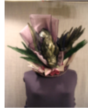
Lady Bracknell's Bird Hat

TV/Film - call for pricing LORT, Opera - 8 weeks $24 Education/Community - 6 weeks $16