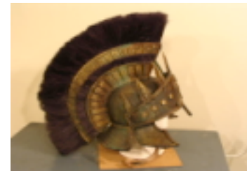
Roman Helmet TV/Film - Call for pricing LORT, Opera - 8 weeks $57 Education/Community - 6 weeks $38

8/1/09 Pricing subject to change without notice