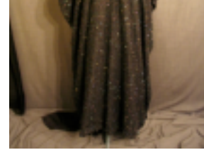
Long Beaded Tunic

8/1/09 Pricing subject to change without notice