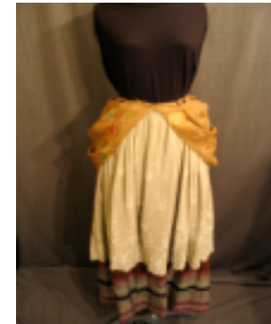
Skirt with Apron and Bustle

8/1/09 Pricing subject to change without notice